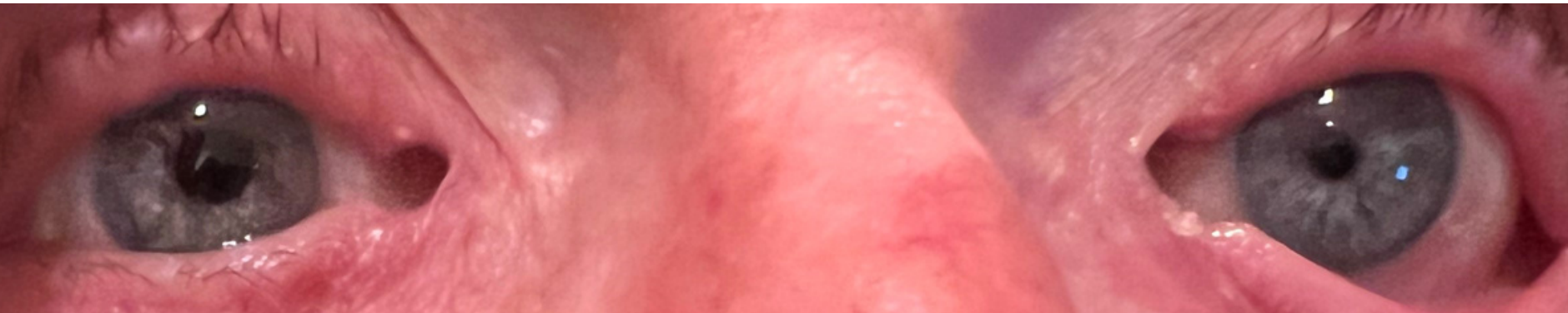
Post Op Bridge Photo

To submit your case, please email ggravino@veo-ophthalmics.com