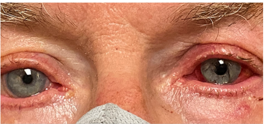
Following Implantation of CUSTOM FLEX ® ARTIFICIAL IRIS in left eye