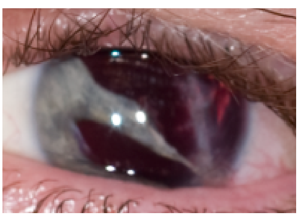
Pre-Op OS 45 y. o. Broken glass bottle injury to left eye, lacerated cornea, iris, and lens capsule. Corrected distance visual acuity 20/150 at time of preoperative photo.